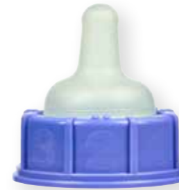
Slow Flow MEPA 0105