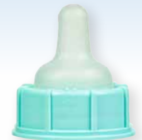
Extra Fast Flow MEPA 0118