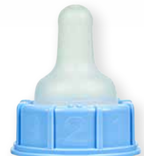
Extra Fast Flow MEPA 0115

“With such a wide range of teat sizes and flow rates, the Mum and I can choose the teat that best suits the baby's drinking technique.