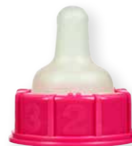
Slow Flow MEPA 0103