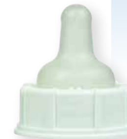
Fast Flow MEPA 0104