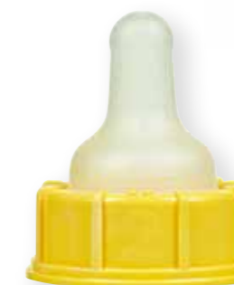
Fast Flow MEPA 0102