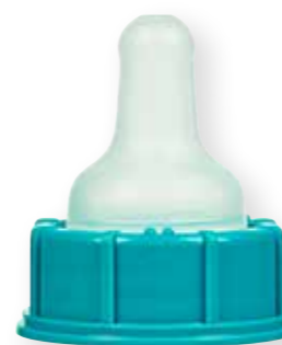
Slow Flow MEPA 0101