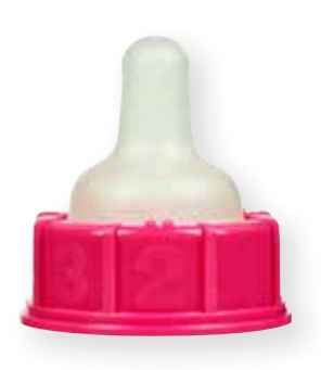
Slow Flow MEPA 0103