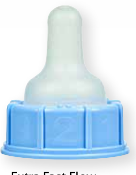
Extra Fast Flow MEPA 0115