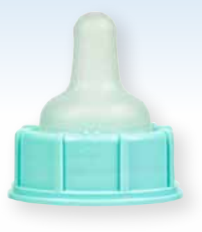
Extra Fast Flow MEPA 0118